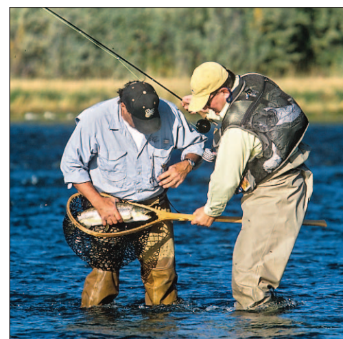
They catch them big on the nearby Bitterroot River.