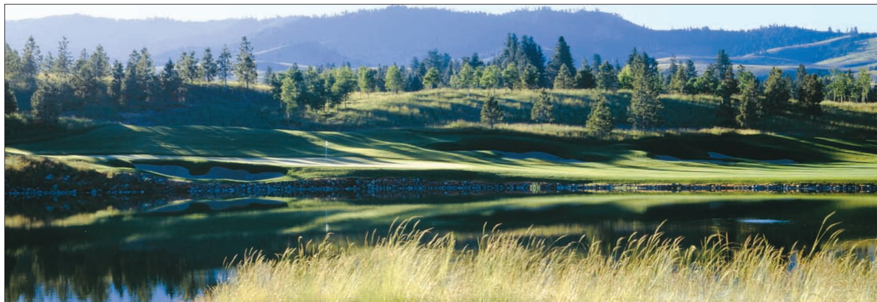
Left: The Stock Farm lake, surrounded by pines and the stunning Bitterroot Mountains in the distance.