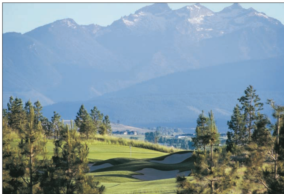
Hole 13, just one example of Fazio's incredible foresight in design.

As is his meticulous and visionary style, it was no mistake that in the initial phases of design, Tom Fazio created the Stock Farm course to look and feel as though it had been there for years. His routing took full advantage of the diverse terrain – the prairie slopes, clusters of Ponderosa pines, and hidden cart paths that weave under natural rock outcropping and traverse an authentic trestle bridge. Just as Fazio planned years earlier, the course has grown and flourished, the rough has matured, and members' golf games continue to evolve.